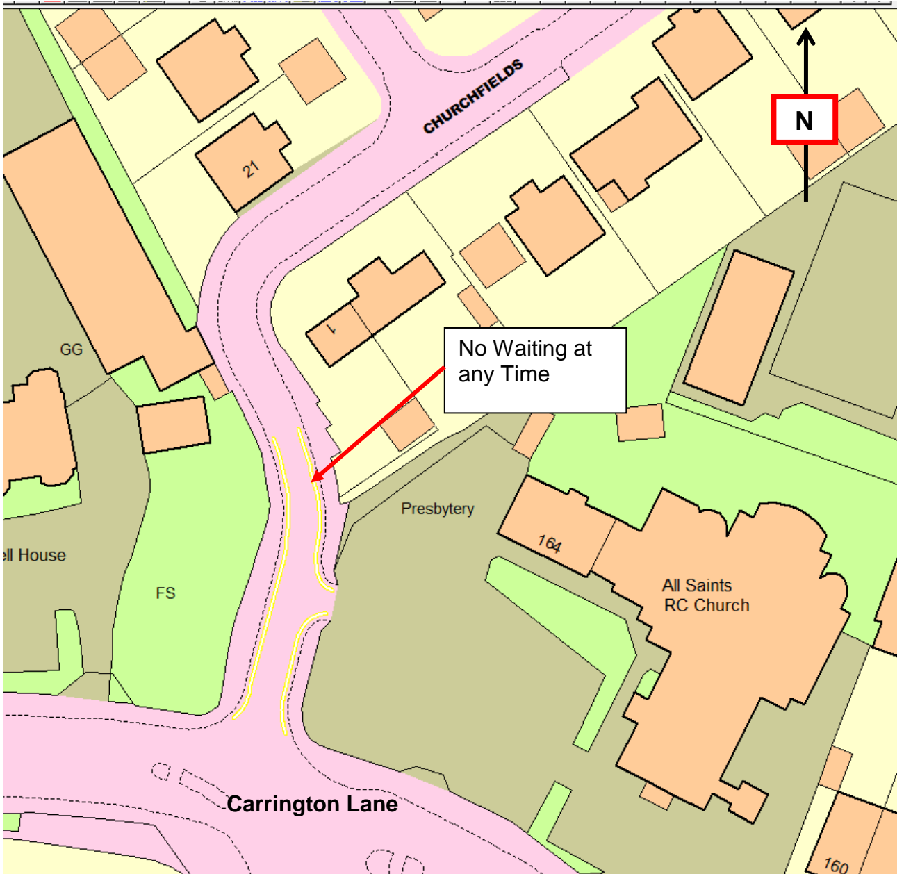
Drawing E8935 – Sheet 3 of 4 – RECOMMENDED TO BE IMPLEMENTED