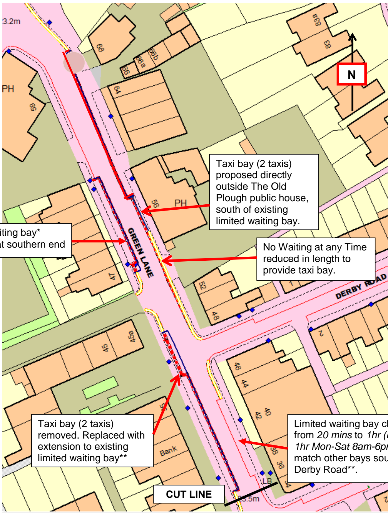
Drawing E8935 – Sheet 1 of 4 – RECOMMENDED TO BE IMPLEMENTED

* Limited Waiting 1 hour No Return 1 hour Mon-Sun 8am-10pm Except Area L permit holders